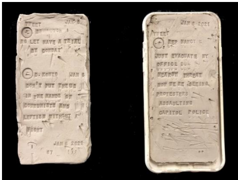
SANDRA RAMOS. Impossible Dialogue: American disputes, 2021