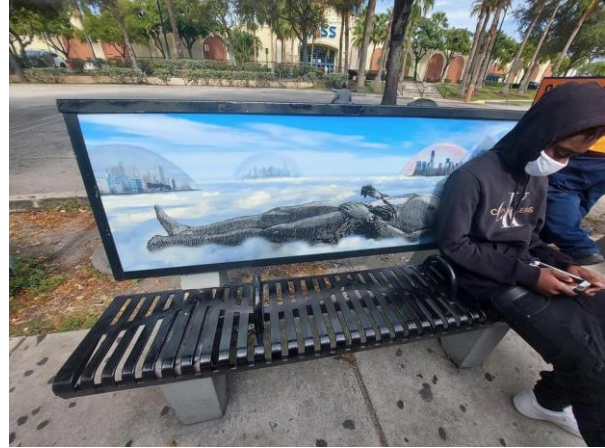
SANDRA RAMOS. Homeless Bench. Digital print. 2021