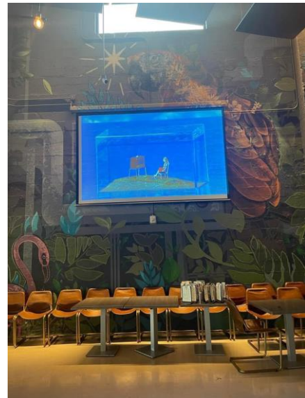
SANDRA RAMOS Aquarium. 3D Short animation (00:04:23 min) 2013