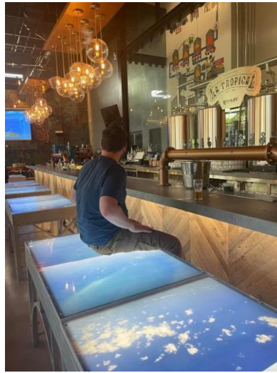
SANDRA RAMOS. 90 Millas / 90 Miles. Installation, 2011.

"My work is a bridge, a line that connects my ideas with those of the others and with the past and the future of my country. It's a path through tolerance, through difference, through the condition of been amazed facing the world and its beauty and through the virtue of innocence and utopia. On it even sadness could be a positive force and distance an passing event"