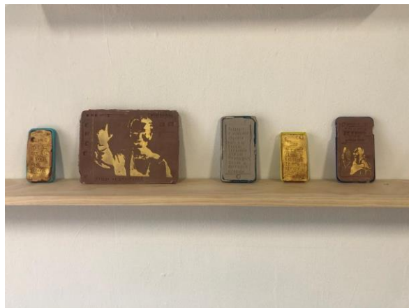
SANDRA RAMOS. Impossible Dialogue: Cuban debates. Installation, clay, plastic, furniture and video. 2021.