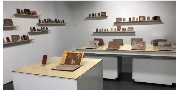
SANDRA RAMOS. Impossible Dialogue. Installation, clay, plastic, furniture and video. 2021.