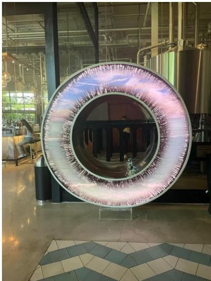
SANDRA RAMOS Transitory Identities. Installation 2013