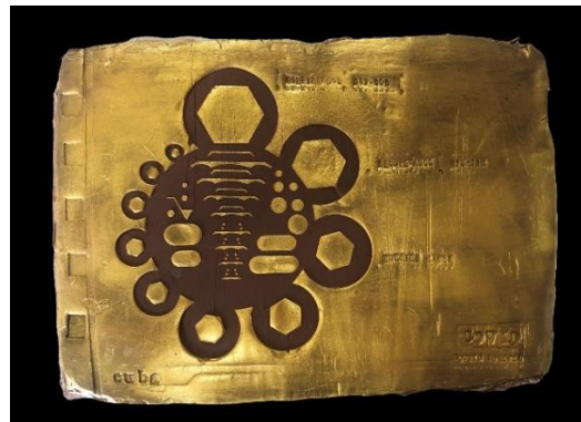
SANDRA RAMOS. Impossible Dialogue: Cuban debates, COVID. 2021