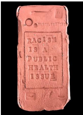
SANDRA RAMOS. Impossible Dialogue: American disputes, 2021