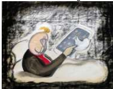
SANDRA RAMOS Trumpito. (Nightmare), 2018. Oil/ canvas