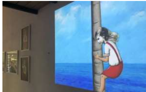
SANDRA RAMOS General view of the exhibition