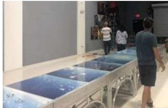
Assembling the installation at the location.