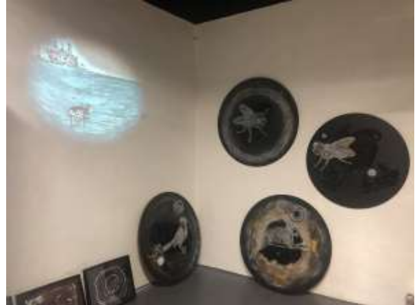
SANDRA RAMOS Untitled, 2018 Ensemble, wood, acrylic, charcoal Courtesy of the artist