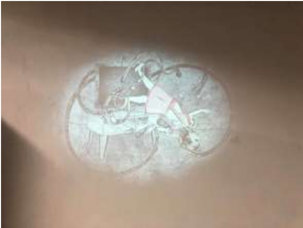
SANDRA RAMOS Two Islands Fighting, 2018 3D short animation

Open Studios & Baker's Brunch. Studio 54 / Bakehouse Art Complex / 561 NW 32nd Street, Miami FL 33127. Thursday, December 6, 9am-12pm