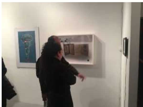
SANDRA RAMOS Series Past Identity, Friends, 2013 Mixed media