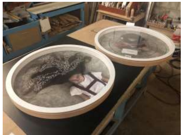
SANDRA RAMOS Untitled, 2018 Ensemble, wood, acrylic, charcoal