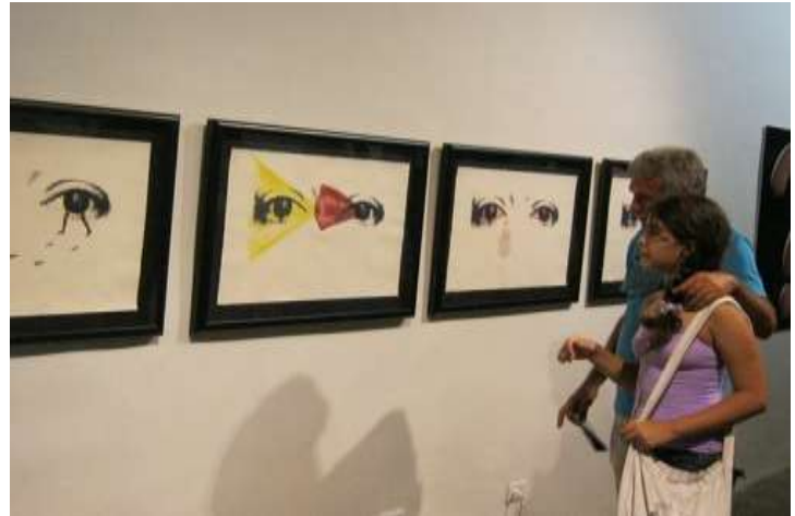
Miedo Secreto / Secret Fear Mixed media, etching. Portfolio. 2011