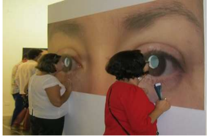
In my head. Video-installation, 2008.